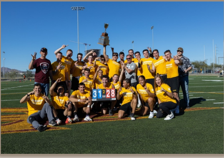
Army overtakes the Air Force in the championship game 31-28 to win the Dean's Cup. **