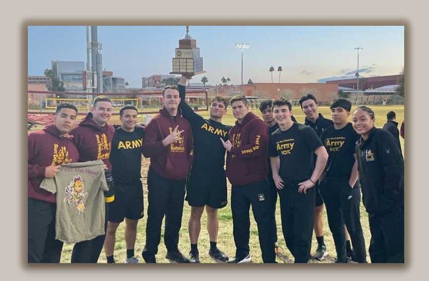
** From The College's of Liberal Arts and Science's Salute to Service article Published on ASU News on Nov 7/ 2022